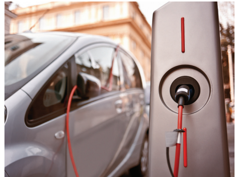
There are already 12,000 electric and plug-in hybrid vehicles registered in Great Britain.

In many ways we are a 'behind the scenes' company. We don't send you a bill for our services. Instead, your supplier passes on part of what you pay them to us to maintain your power supply.